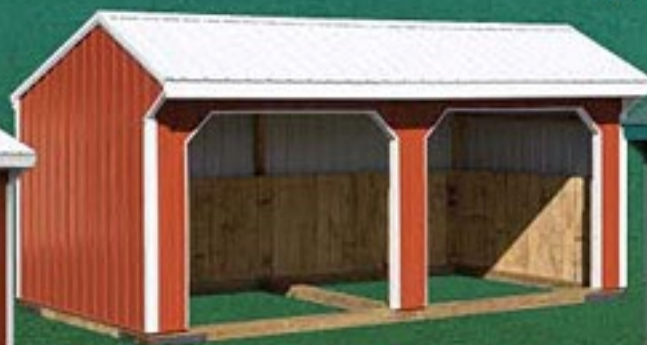
10'x24' with red metal siding and insulated white metal roof