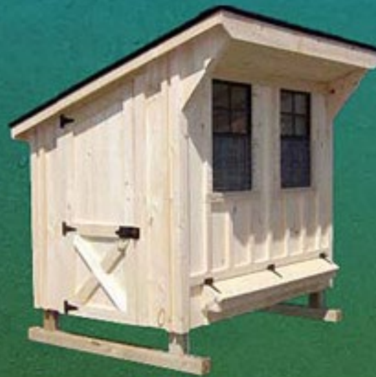
4x6' chicken coop with roll away egg box