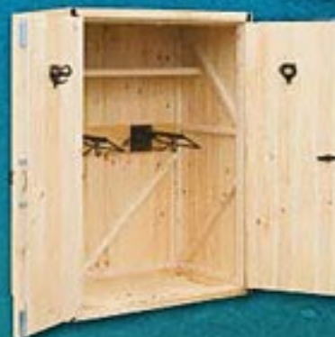
Double saddle and/or harness cabinet with shelf. size 51 \frac{1}{2} " x 72"H x 32"D