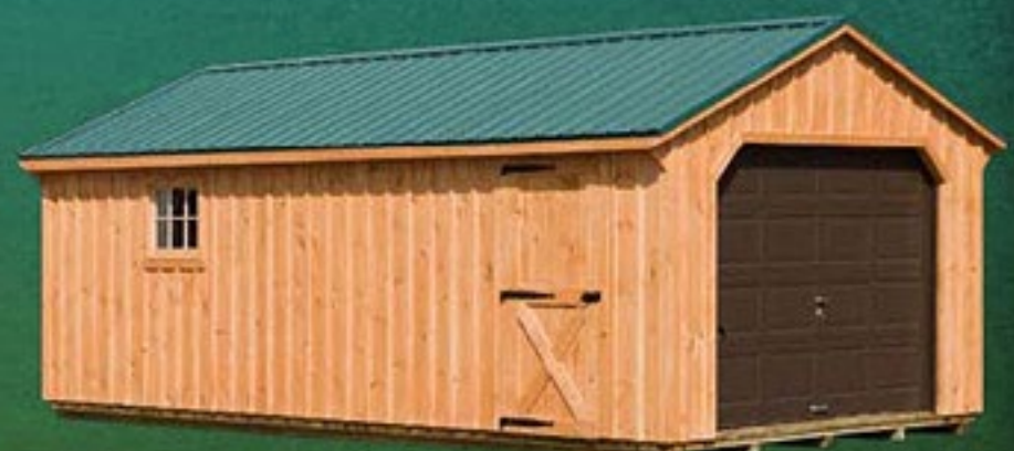
12x24' shown with green metal roof and natural stain