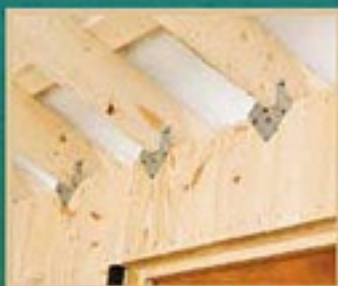
Brackets for hurricane regions