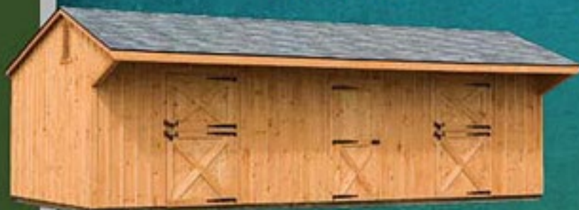
12'x32' with optional 4' overhang, gable vent, and natural stain