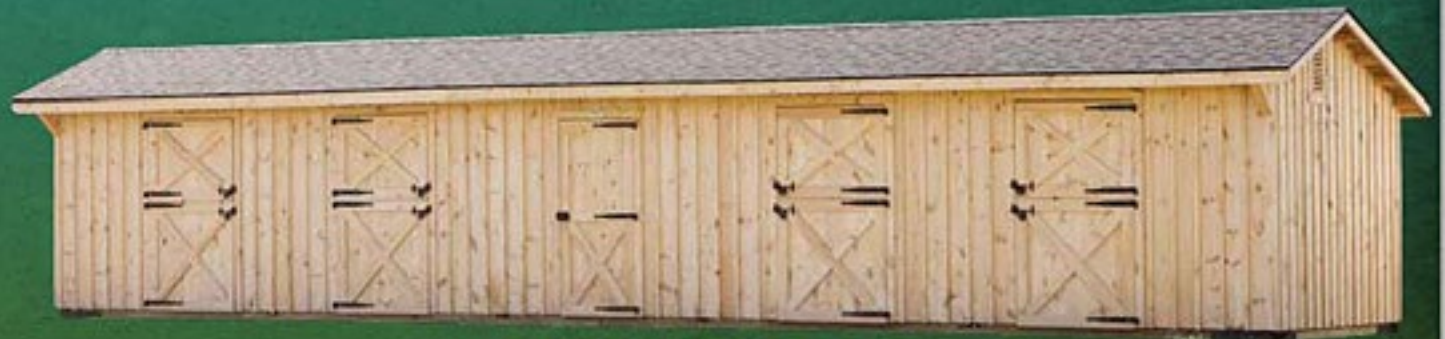
12x50' with optional 12' gable overhang