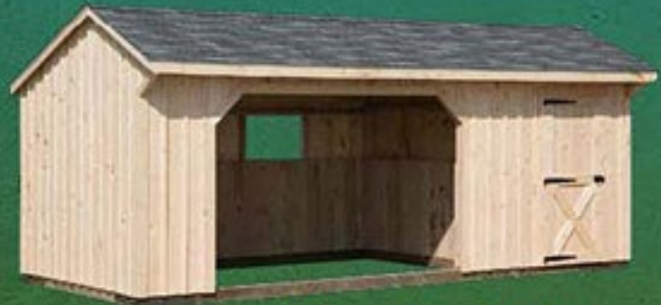
10x24' - with optional drop vent and storage room