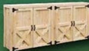
Consecutive wall cabinets for custom sizes