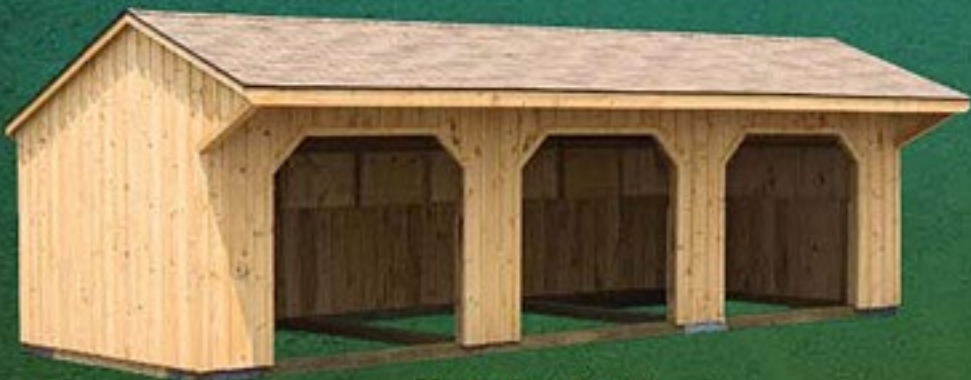
10x30' with optional 4' overhang