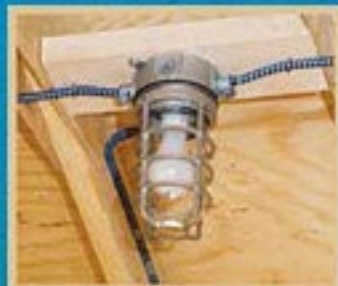
Vapor proof lights with die cast guard