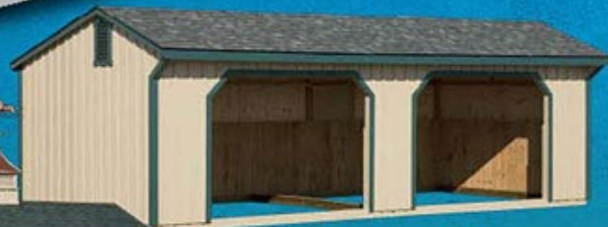
10'x24' tan paint with green trim, gable vent