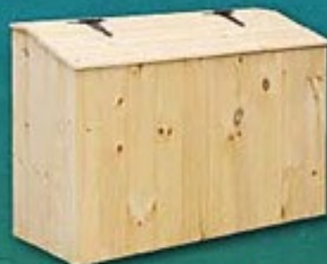
3 compartment feed chest size 60 \frac{1}{2} "w x 34"H x 17 \frac{1}{2} "D