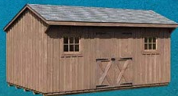
12x16' Quaker with mushroom stain