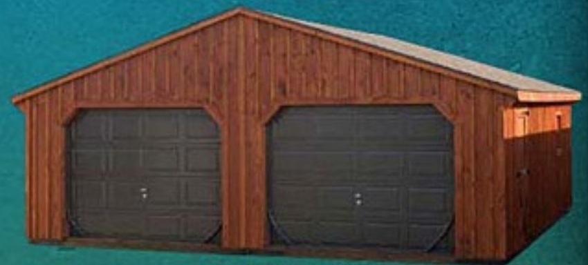
24x24' with cedar stain