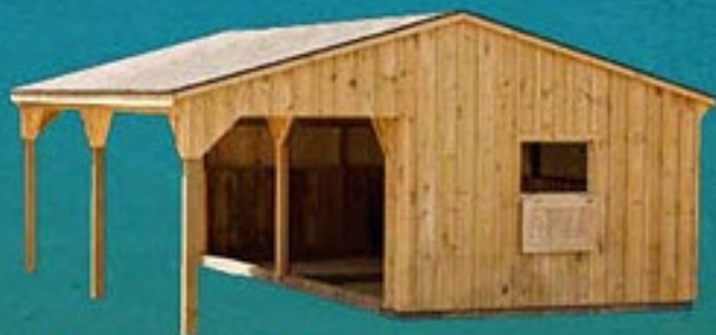
10x24' Run-in shed with optional hinged 8' overhang and drop vent