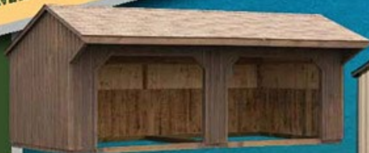
12'x24' optional 4' overhang and mushroom stain