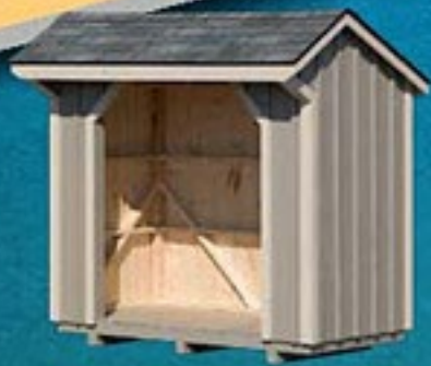
4x8' wood shed shown with clay paint and tan trim