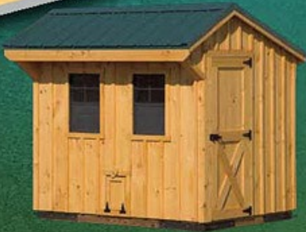
6x8' with green metal roof