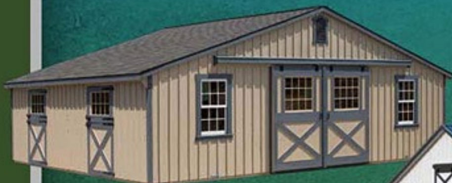
36x24' four pitch barn with optional tan paint, blue trim, double hung windows, and Dutch door with windows