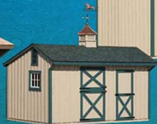
10'x16' horse barn with optional tan paint, green trim, cupola with horse weather vane, gable vent