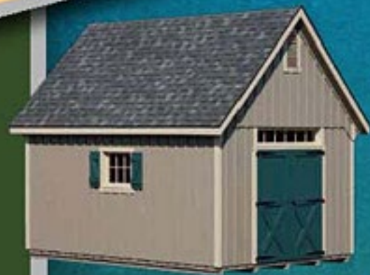
12x16' with 12 pitch hinged roof, clay paint and tan trim