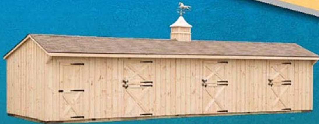
12x44' with optional E-24 cupola, horse weather vane