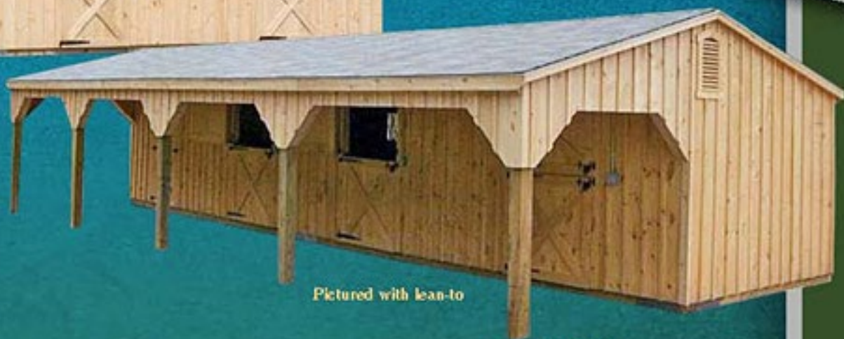
Pictured with lean-to