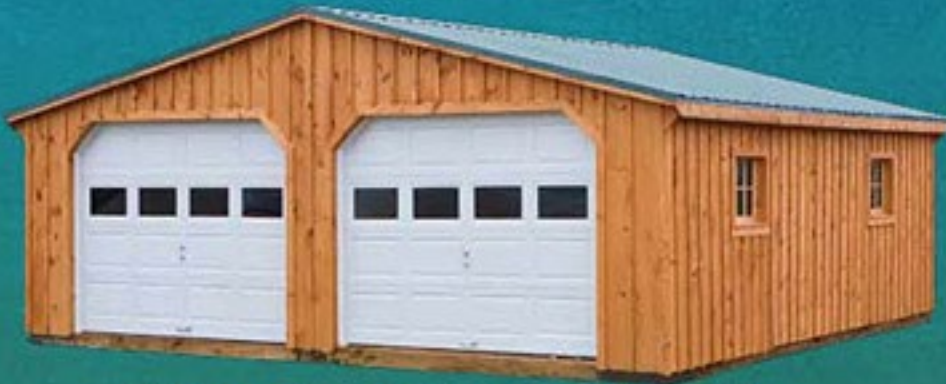
24x24' shown with natural stain and optional windows and doors