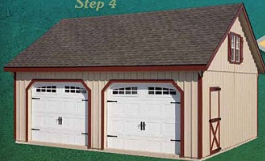
20x24' two story double wide garage with 8 pitch roof, and shown with optional homestead doors and tan paint with red trim