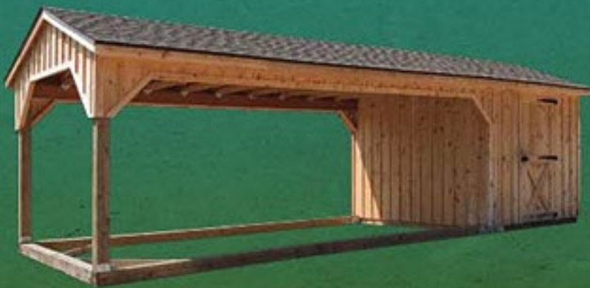
10x26' carport - 6x10' storage room, 20' carport