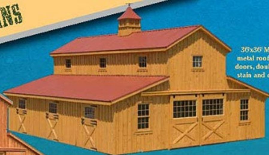
36x36' Monitor with optional red metal roof, windows in doors, dutch doors, double hung windows, natural stain and cupola with weather vane.