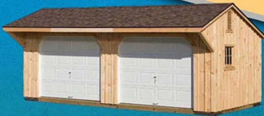
12x24' shown with 4' overhang