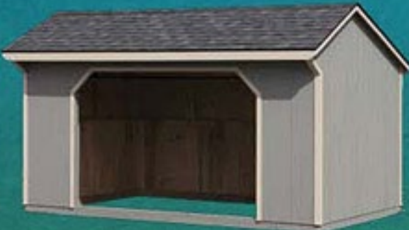
10x18' with optional painted T1-11 siding