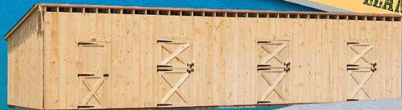
Pictured without lean-to