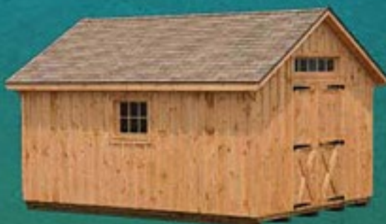
12x16' A-frame shown with 7 pitch roof extended overhang, transom windows, and natural stain