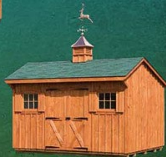
10x12' Quaker with cedar stain, shutters, B-20 cupola and deer weather vane