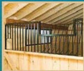
Grill with hay rack and feed hole