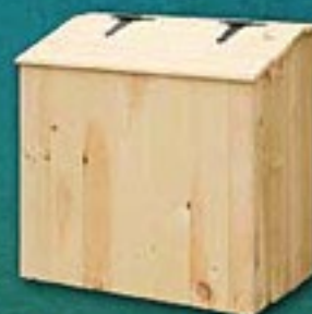
2 compartment feed chest size 34"w x 34"H x 17 \frac{1}{2} "D