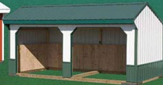
10'x24' with 2 tone metal siding and insulated green metal roof