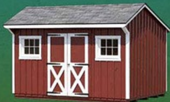
10x16' shown with red paint, and white trim