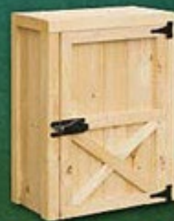
Single door wall cabinet size 27"w x 36"H x 14 \frac{1}{4} "D