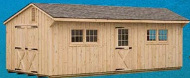
10x30' Quaker with gable vent, optional service door with window, 2 extra windows