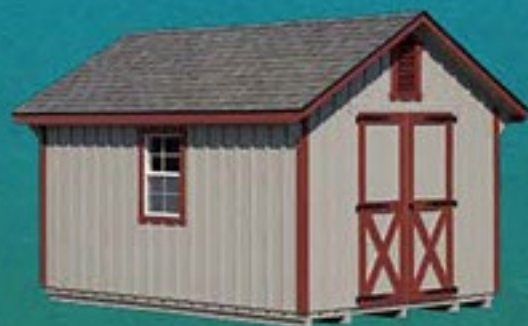
10x14' A-frame shown with clay paint and 7 pitch roof