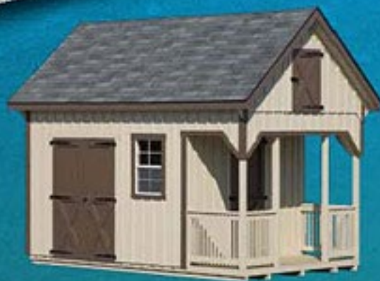
10x16' 10 pitch roof shown with optional porch pictured in tan color and brown trim