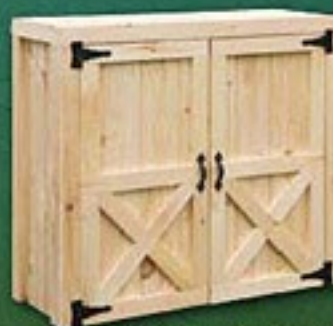
Double door wall cabinet size 39"w x 36"H x 14 \frac{1}{4} "D