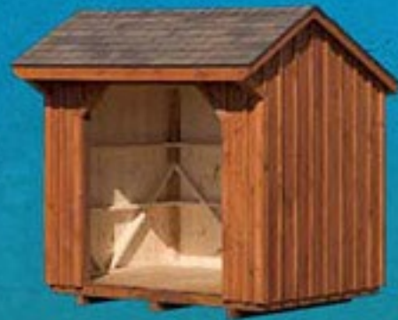
6x8' wood shed shown with cedar stain