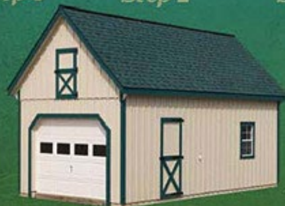
12x24' garage with 12 pitch roof, tan paint and green trim