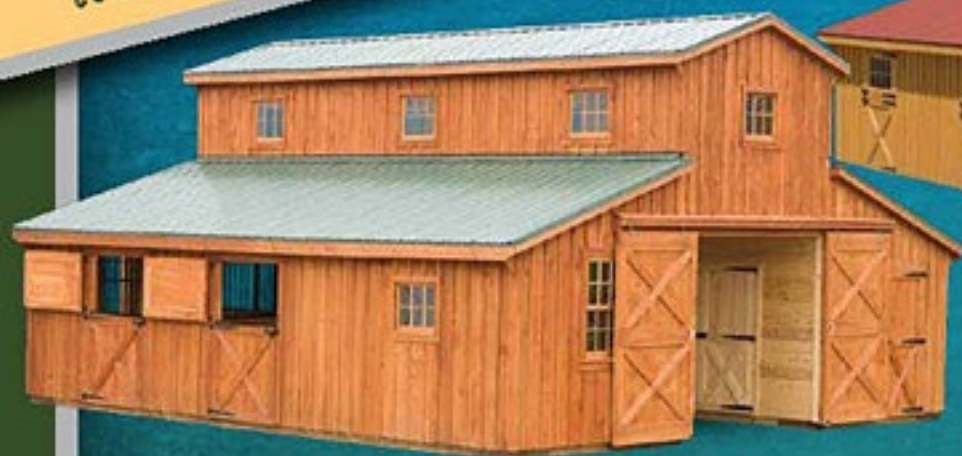
30x30' monitor with optional green metal roof, Dutch doors and cedar stain