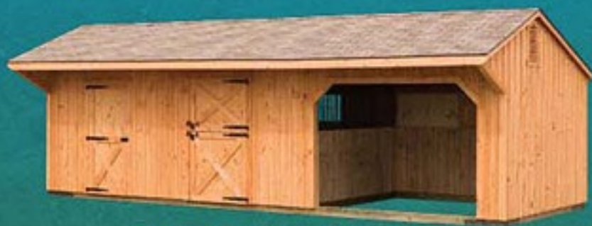
12'x30' combo building, 12'x12' run-in, 12'x12' stall and 6'x12' storage room with optional 4' overhang, and natural stain