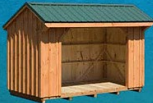
6x12' wood shed shown with natural stain and green metal roof