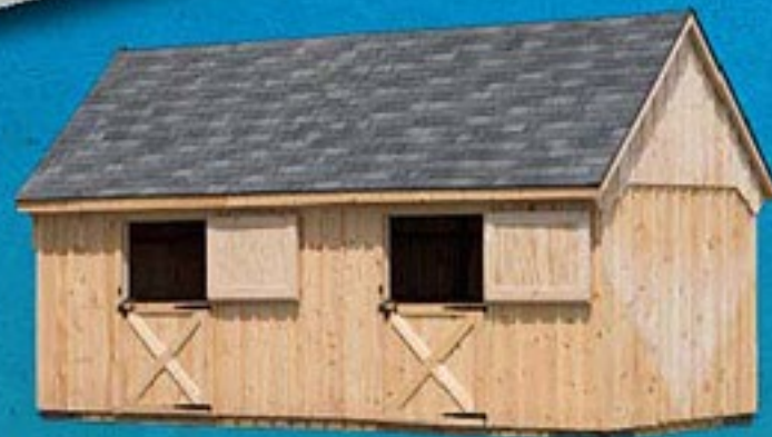
10x24' with 12 pitch roof

The buildings on this page all feature a special hinged roof. This hinged roof structure is just as strong and as durable as their non-hinged counterparts. It allows us to "knock down" buildings that are too large to be transported by conventional means. Once the building is placed in its intended site, the hinged roof is folded and secured in place.