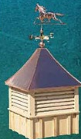
Cupola available with weather vane