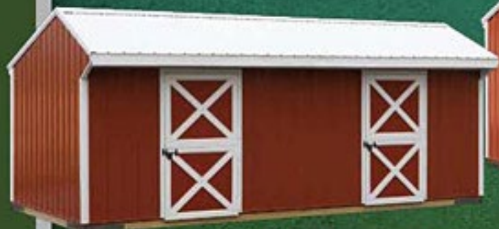
10'x24' with red metal siding, insulated white metal roof, and optional metal Dutch doors