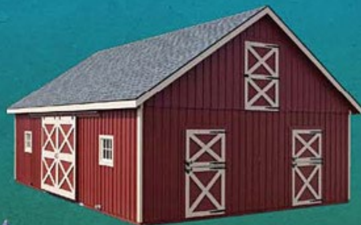
24x36 Double wide horse barn with loft optional paint and Dutch doors